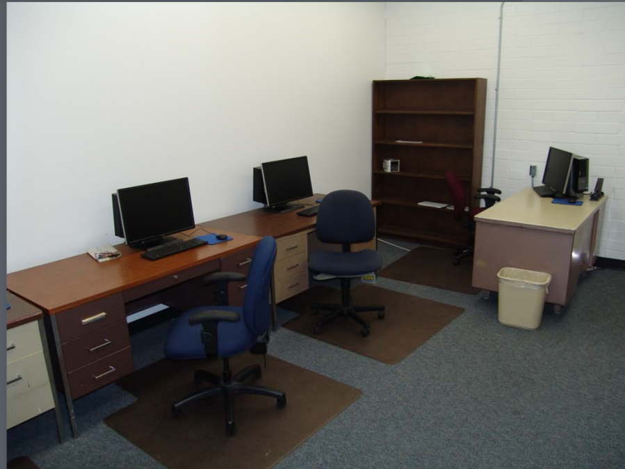
Photos of previous space with old furniture