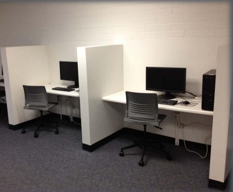
Photo of newly upgraded space with new chairs and painted walls now the Veteran's Study Area