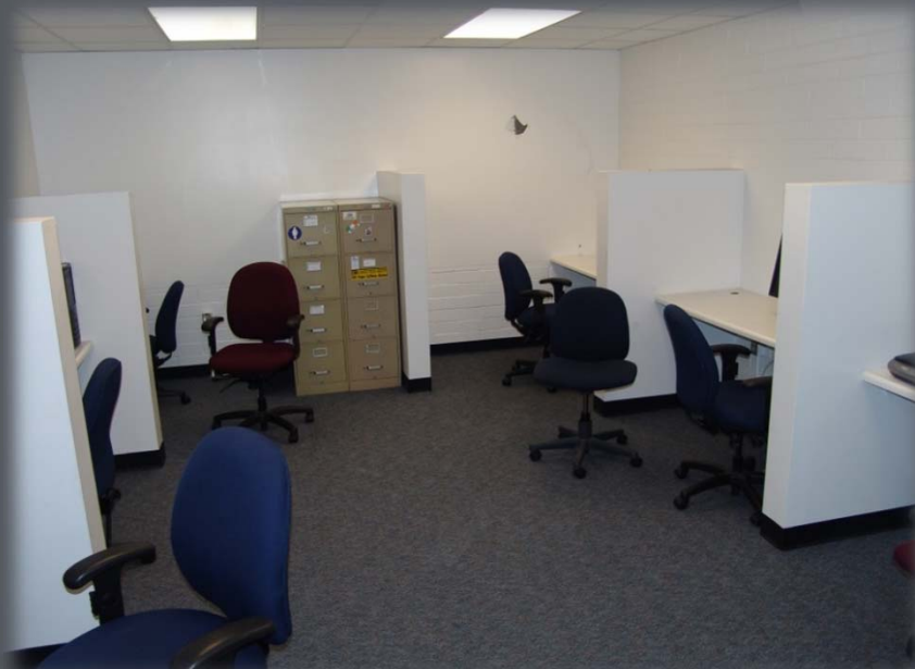
Photo of the previous space as the Adjunct's Study Area now the Veteran's Study Area